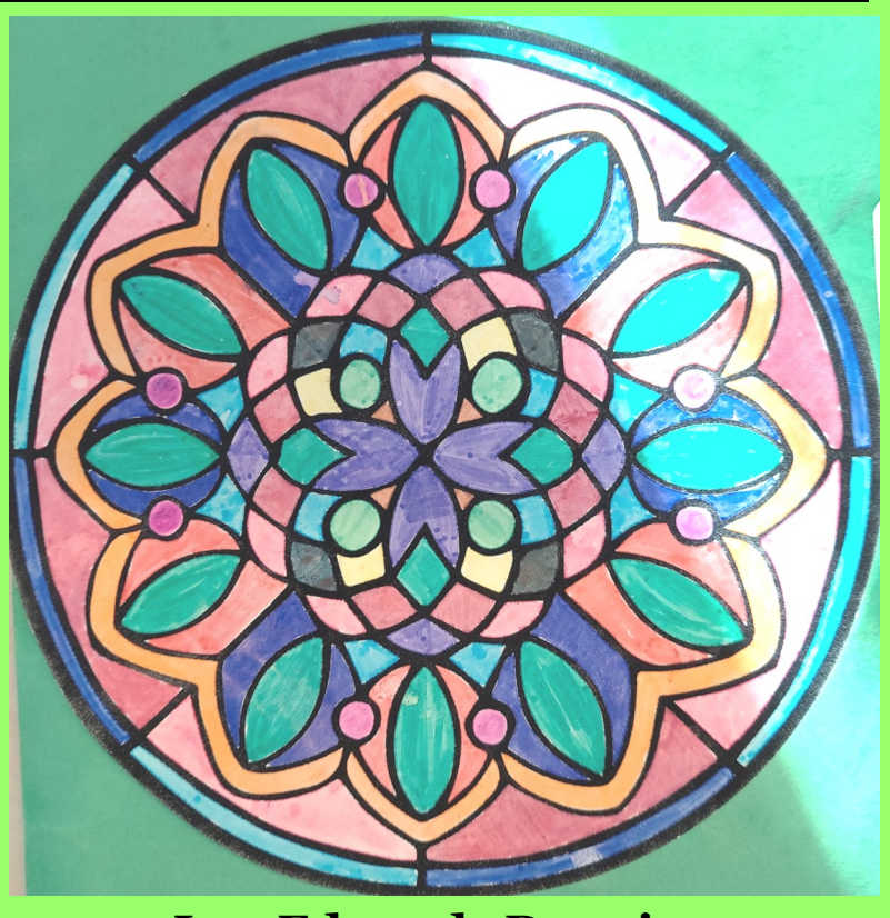
Lux Edwards Drawing